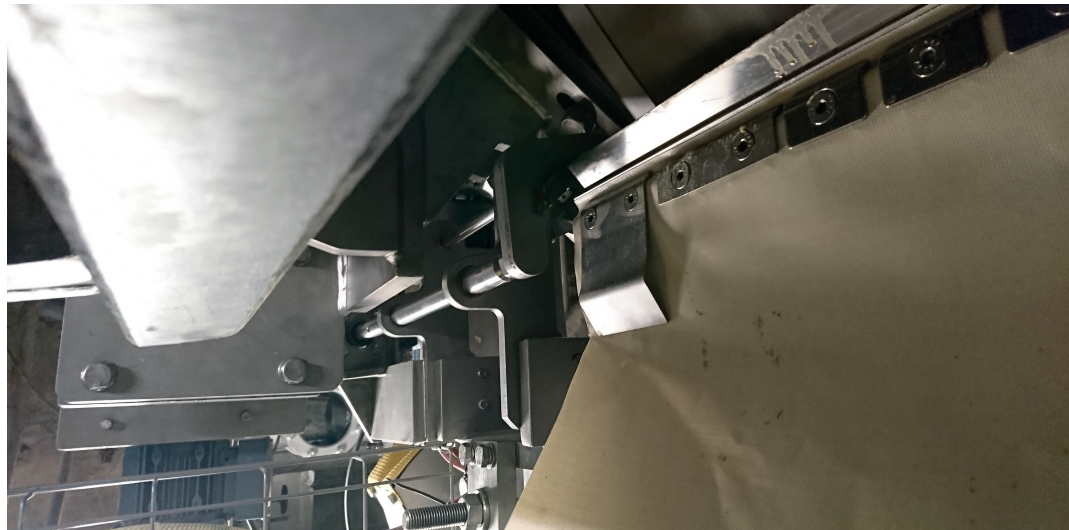
Figure 4. Example of installed extractor device.

After having equipped all the Group facilities (Diecimo, Porcari, Castelnuovo, Laval-sur-Vologne) and having completed the last Yankee area rebuilding of PM10 in France, the good relationship between Oradoc and Lucart continues through the new machine: even the new PM12 was equipped with all the doctoring supplied by Oradoc.