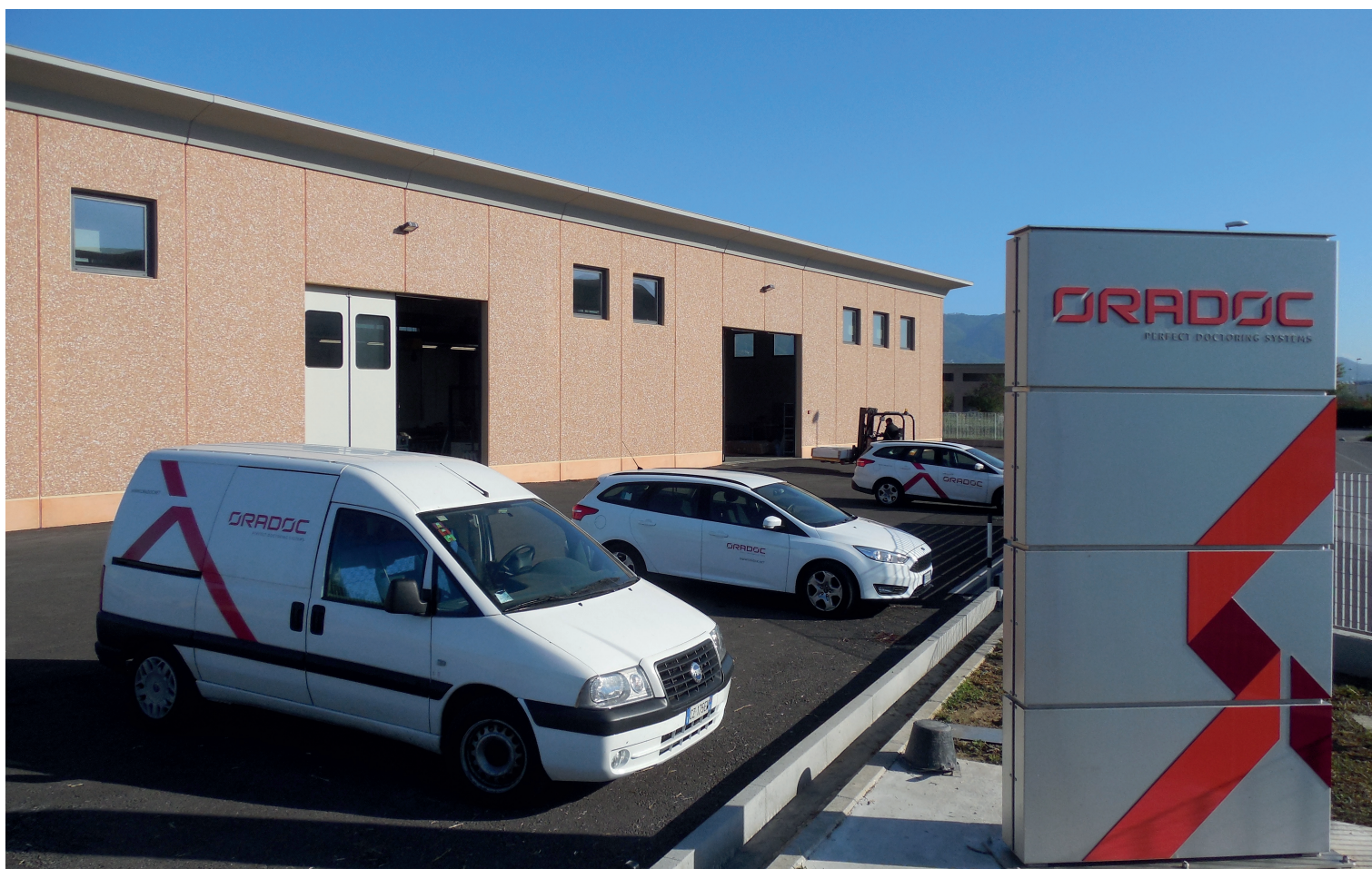
Figure 1. New Oradoc headquarters in Lucca.

By Sara Giunchi , Communication and Marketing, Oradoc Srl