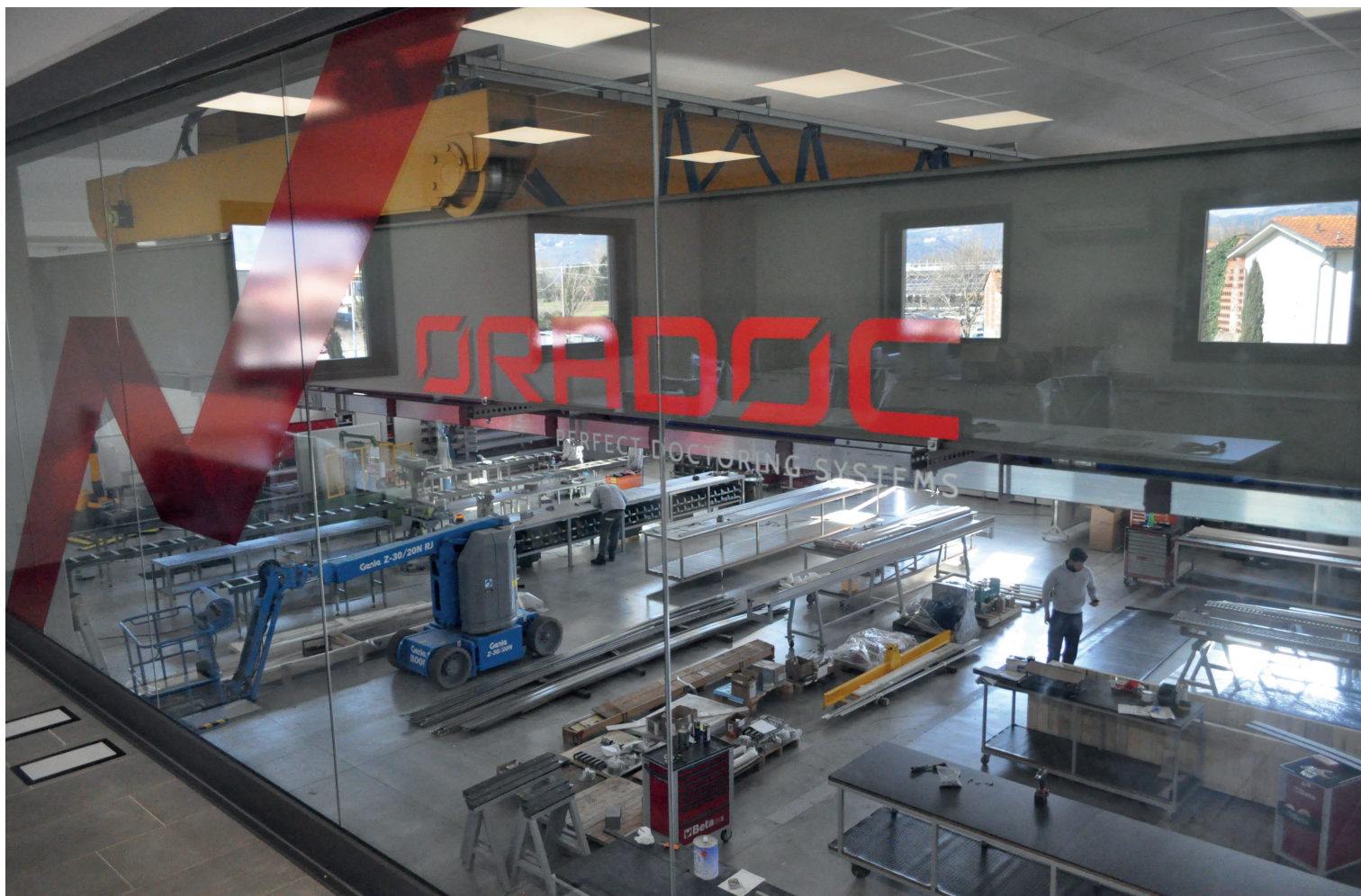
Figure 2. New Oradoc facilities and workshop.

employees in 10 production plants (five in Italy, one in France, one in Hungary and three in Spain) and a Logistic Centre in Italy, which makes Lucart one of the standout players among tissue products producers.