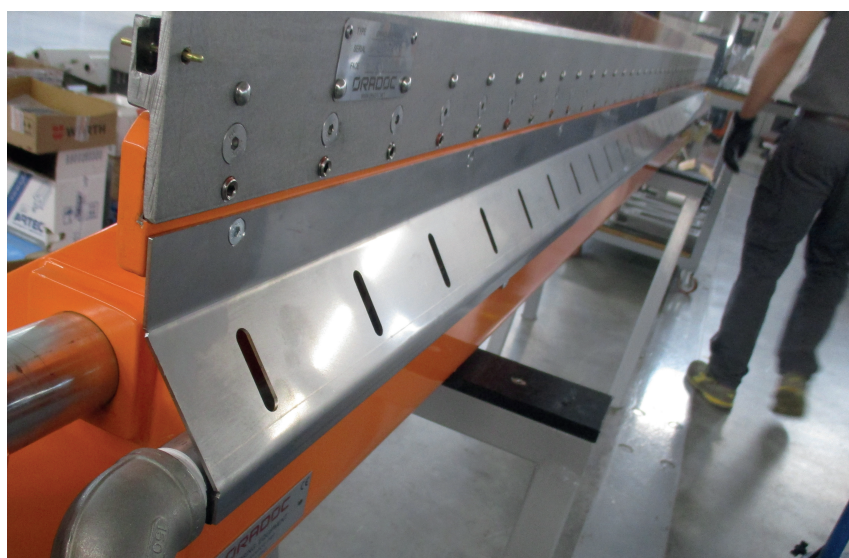
Figure 3. OraClean doctors are simple and effective and can be used in all machine positions.

Oradoc equipped all the positions of Lucart's Porcari plant production line.