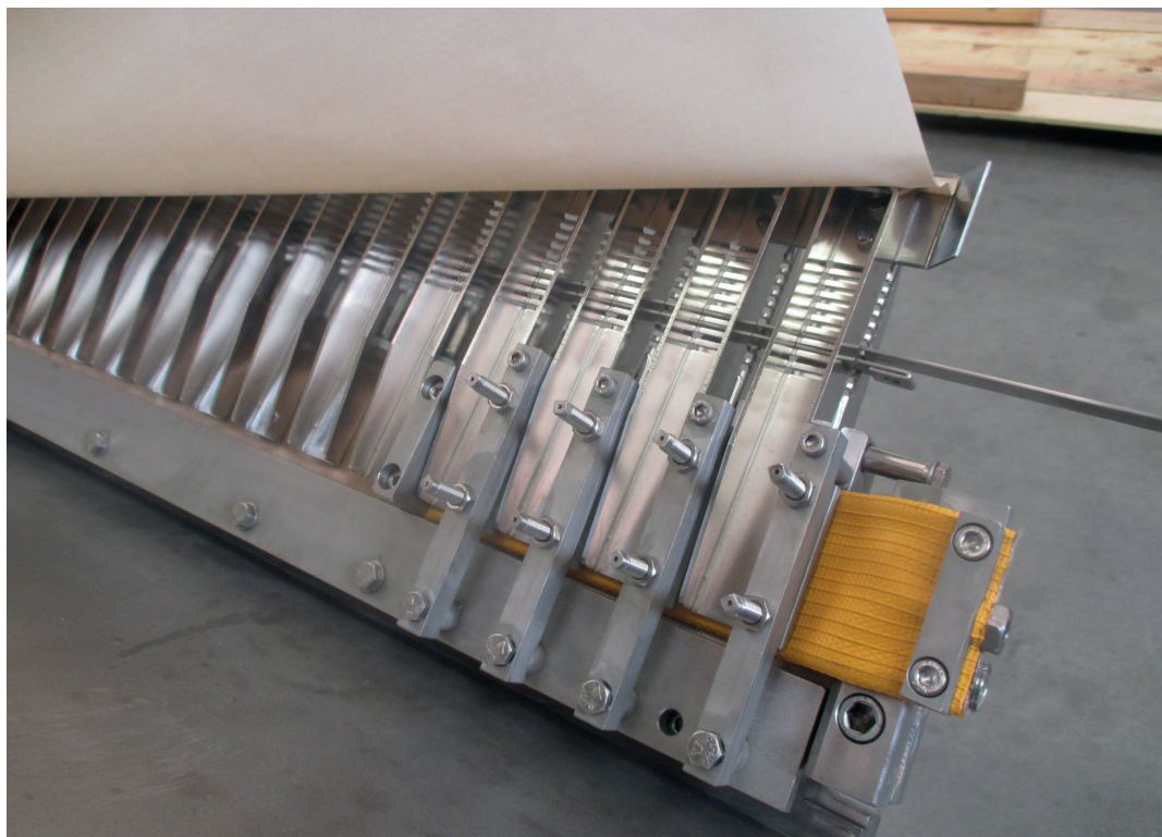
Figure 6. ELV - Edge Load Variation system.

The ELV system (Edge Load Variation) installed on the creping doctor safeguards continuous and independent pressure control at the edges of the cylinder, to perfectly remove the fibre buildups, thus maintaining the right blade load along the entire paper width.