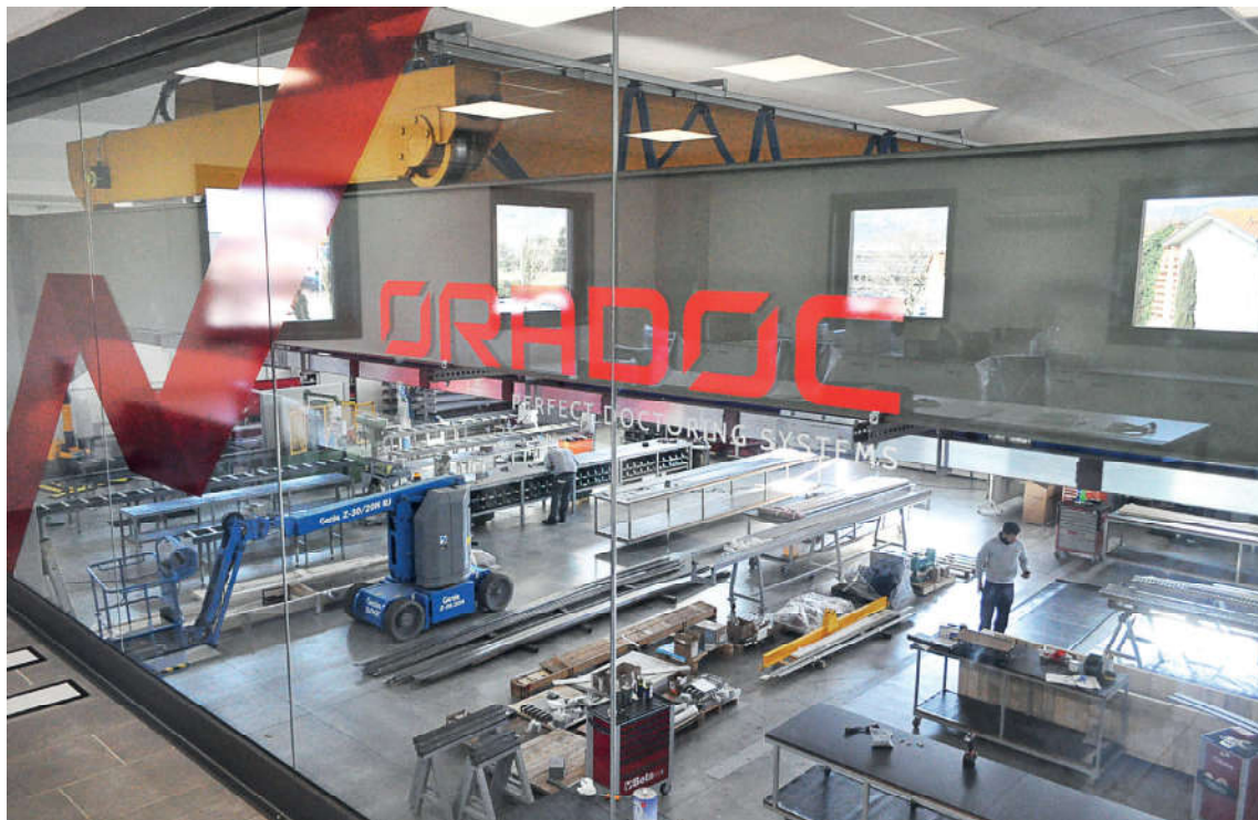
► New Oradoc facilities and workshop.