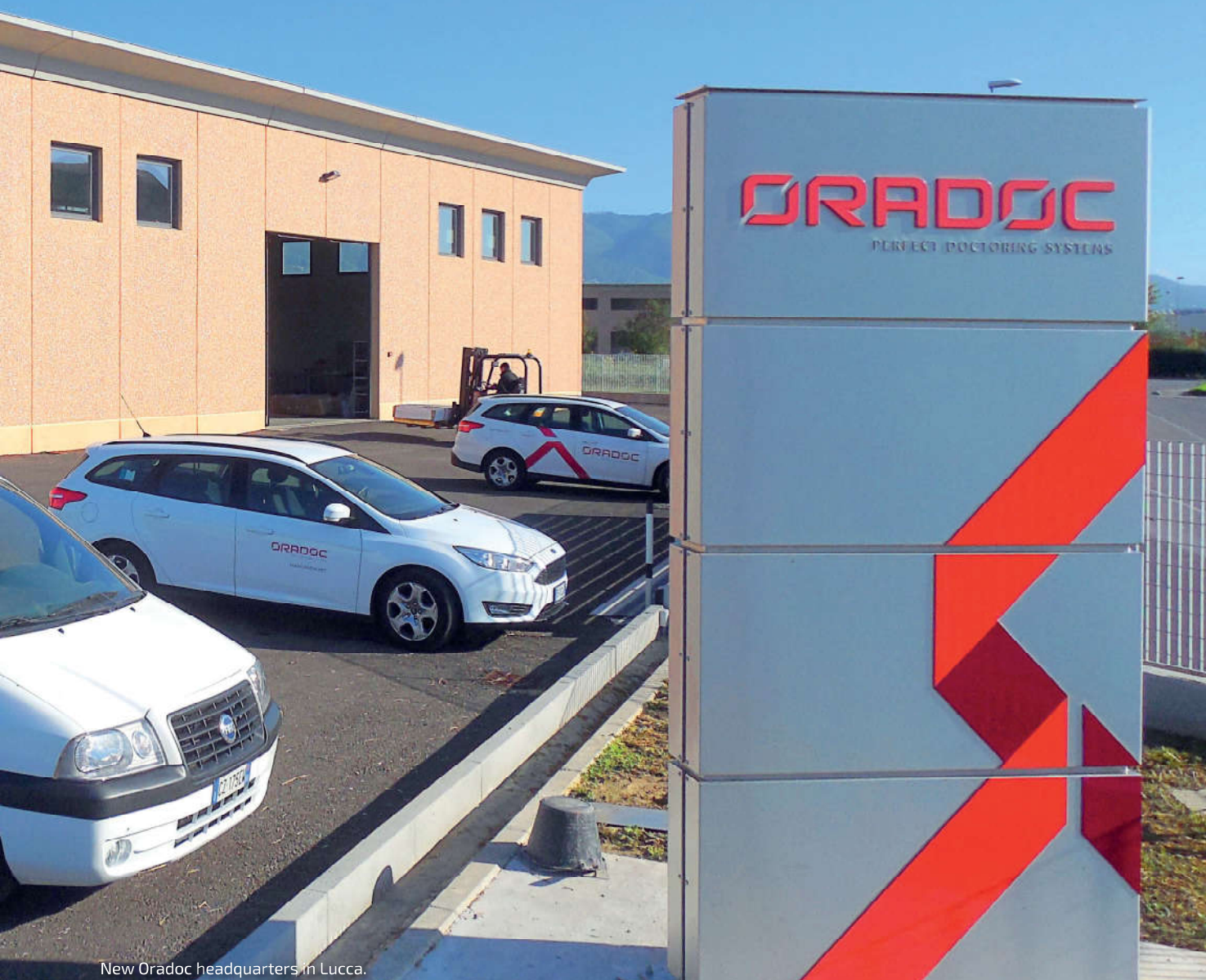
New Oradoc headquarters in Lucca.