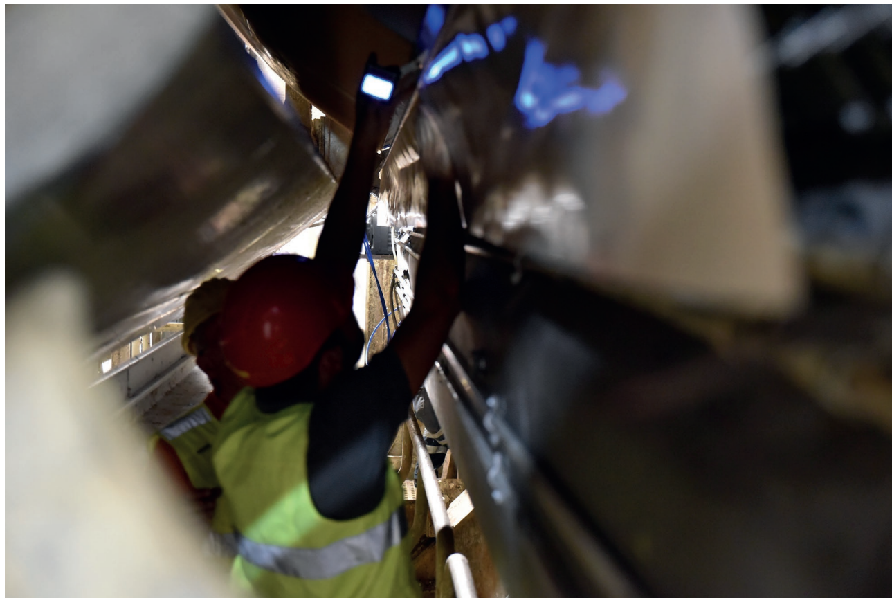
Figure 2. Oradoc technicians checking blade angle.

OraCrepe blade holder with loading tube of 45mm.