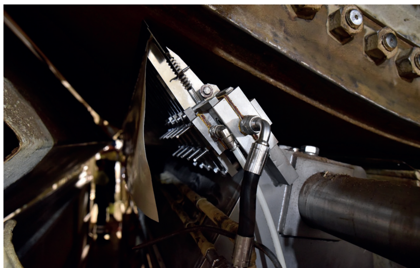
Figure 3. OraCrepe blade holder installed on Yankee roll.

The new installation performed well almost immediately, allowing Essity