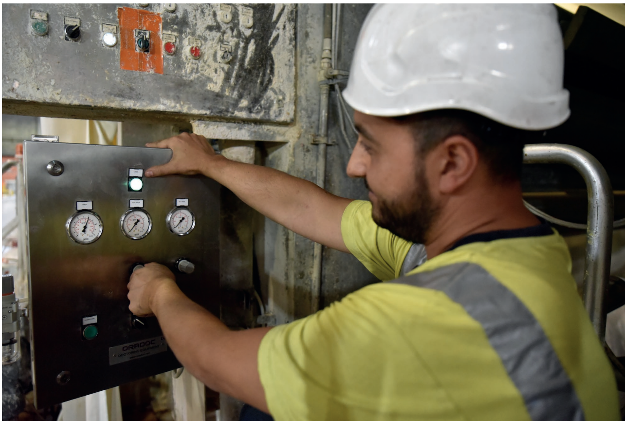
Figure 5. Essity Maintenance Leader setting pressure regulation on Oradoc control panel.

The safety risks for the operator have been significantly reduced with the new blade extraction device