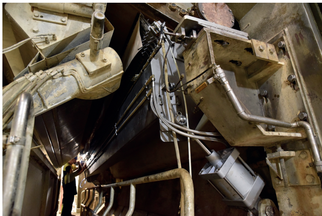
Figure 1. Creping doctor installation on Yankee.

Essity is a leading global hygiene and health company dedicated to improving well-being through their